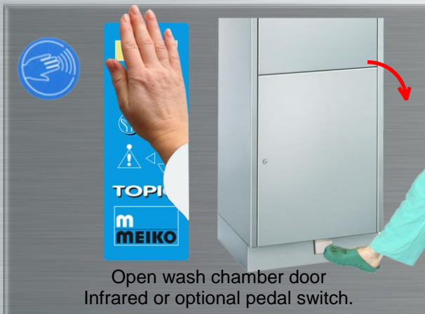
Open wash chamber door Infrared or optional pedal switch.

▲ ▼ keys for number of programme sequences ◀ ▶ keys see detailed operating instructions