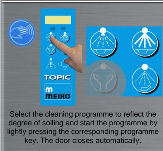
Select the cleaning programme to reflect the degree of soiling and start the programme by lightly pressing the corresponding programme key. The door closes automatically.