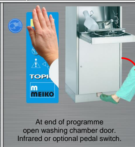
At end of programme open washing chamber door. Infrared or optional pedal switch.